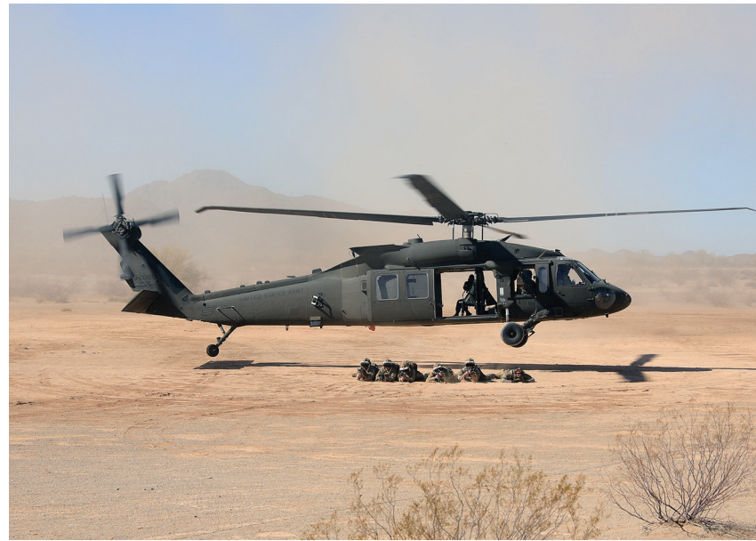
Soldiers from the 82nd Airborne Division take part in an Integrated Visual Augmentation System-enabled air assault exercise on 3 November 2021, on Yuma Proving Ground, Arizona, as part of Project Convergence 21.

Cyber and electronic warfare capabilities provide additional options for persistently competing. MDEBs can employ electronic transmissions to stimulate enemy radars, jammers, cyber defenses and ground units into responses that the MDTFs can analyze. 30 MDEBs also contain the capacity to penetrate adversary cyber networks. During competition, these networks would be monitored for intelligence and scanned for vulnerabilities that the MDTFs could later exploit during a crisis or conflict. The MDEBs could intentionally reveal some successful cyber penetrations to an adversary to achieve cognitive and deterrent effects by signaling potential escalation costs.