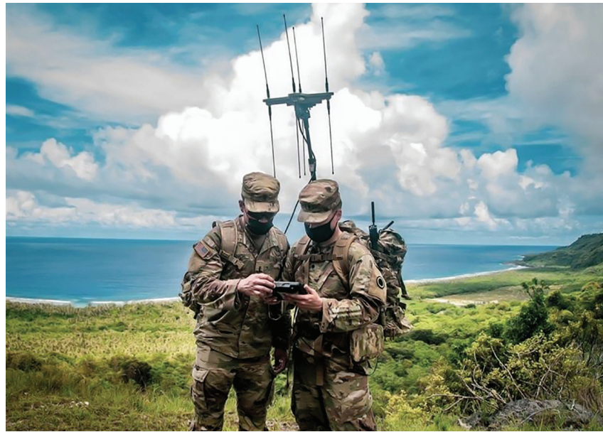
Members of the Army’s Multi-Domain Task Force, or MDTF, conduct operations. Initiated in March 2017 as a pilot program, the MDTF was designed to defeat an enemy’s A2/AD capabilities in the Indo-Pacific region. Later this year, a second MDTF will stand up in Europe. A third task force may also stand up and serve the Indo-Pacific next year.

The Army is creating All-Domain Operations Centers (ADOCs) that integrate the diverse components of the MDTFs. ADOCs are intended to serve as command nodes that enhance information-sharing, allowing commanders to see data from the field and provide faster analyses to ensure that MDTFs persistently compete from home station and while employed forward. 22 The Army intends the ADOCs to be “joint from inception” 23 —fully networked across the joint interorganizational multinational (JIM) spectrum. It is not yet clear at what echelon the ADOCs will provide this integration and whether they would function complementary to centers like the Air Force’s