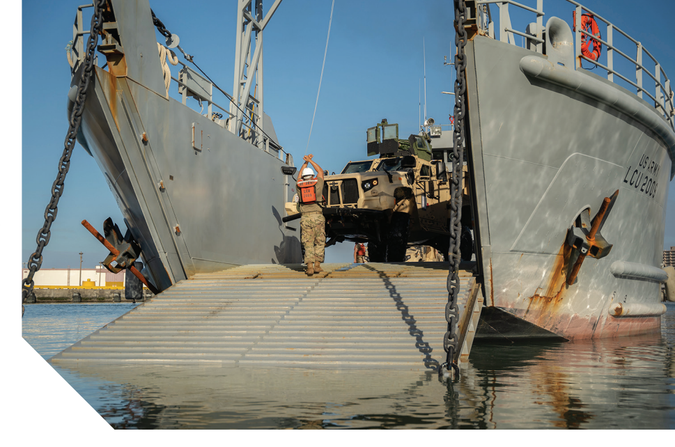
A U.S. Army Soldier assigned to U.S. Army Landing Craft Utility Calaboza guides a Marine Corps Joint Light Tactical Vehicle into position during exercise Winter Workhorse 23 at Naha Military Port, Okinawa, Japan, 4 December 2022. Winter Workhorse is an annual exercise that provides training in carrying out mission-essential tasks in forward-deployed, austere environments.

fact that is often overlooked when considering the preponderance of water covering the region's map. Yet the inter-dependencies illuminate the reality that only the Army can provide land combat and support forces at the required scale and with the depth of capabilities to allow a joint and combined coalition to deter or, if required, to defeat a peer adversary like the PRC, especially in a protracted conflict.