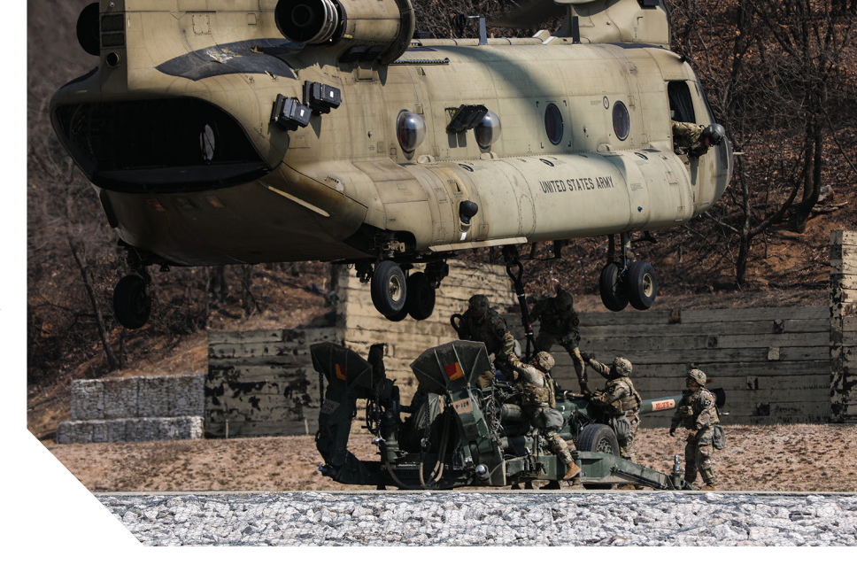
U.S. Army Soldiers assigned to the 2nd Battalion, 17th Field Artillery Regiment, 2nd Stryker Brigade Combat Team, 2nd Infantry Division and the 2nd Infantry Division Combat Aviation Brigade conduct an air insertion of three M777 Howitzers during Exercise Warrior Shield at Rodriguez Live Fire Complex, South Korea, 19 March 2023. Warrior Shield is a combined training event with the Republic of Korea Army, highlighting the combined aspects of military operations.

responsibility is the biggest and most complex operating environment on Earth, including not only the world's largest maritime expanse but also the bulk of the Asian continent, the Australian continent and 300,000 square miles of Pacific Island landmasses. Moreover, the world's largest armies are found in Asia, including the Indian Army, the People's Liberation Army Army (PLAA) and the Korean People's Army Ground Force.