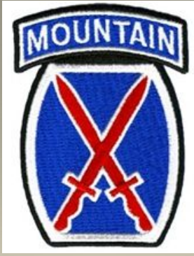
10 th Mountain Division (Light) "Climb to Glory"