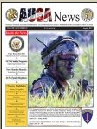
August AUSA News