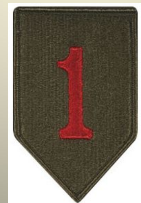
1 st Infantry Division "No mission too difficult, no sacrifice too great, duty first"