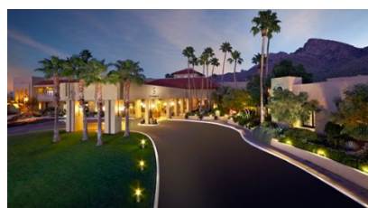
Hilton Tucson El Conquistador Golf and Tennis Resort www.HiltonElConquistador.com