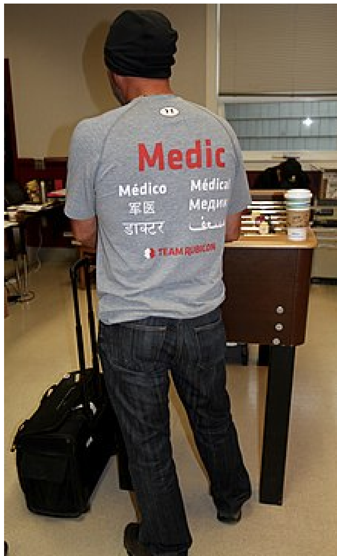
Team Rubicon Medic shirt – medics have to be specially qualified to be able to wear this shirt