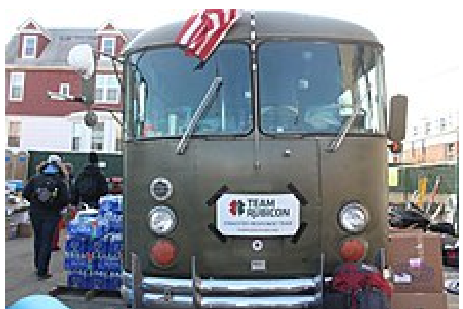
Palantir HQ on green school bus during Hurricane Sandy operation on the Rockaways