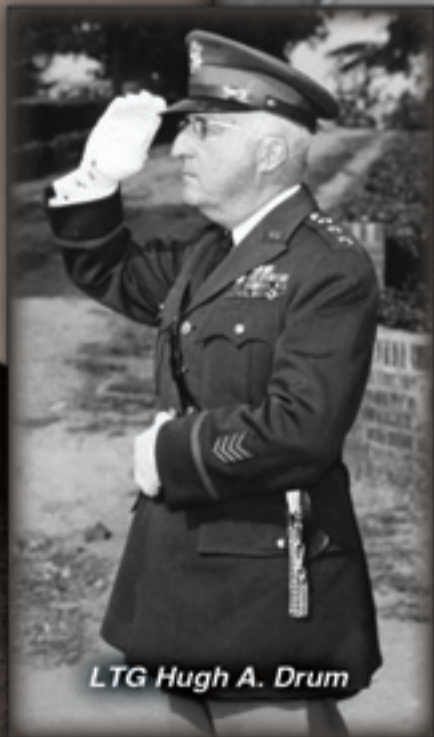
LTG Hugh A. Drum