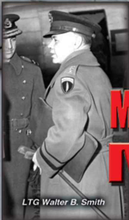
LTG Walter B. Smith