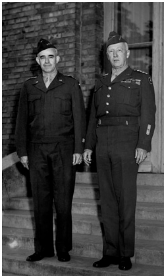
GEN Bradley and GEN Patton