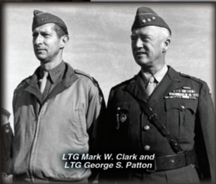
LTG Mark W. Clark and LTG George S. Patton