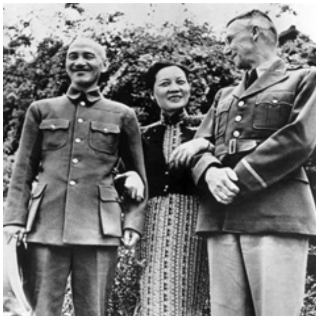
GEN Joseph Stilwell with Chiang Kai-shek and Madame Chiang.