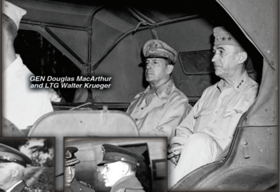
GEN Douglas MacArthur and LTG Walter Krueger