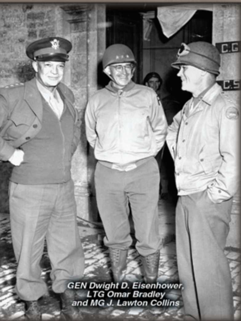
GEN Dwight D. Eisenhower, LTG Omar Bradley and MG J. Lawton Collins