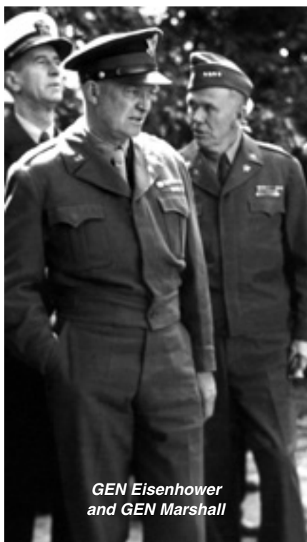
GEN Eisenhower and GEN Marshall

B. Ridgway, Maxwell D. Taylor, J. Lawton Collins and Walter Bedell Smith. All were destined to hold senior command and staff positions in the war. Indeed, Marshall held up Bradley's promotion to corps command four times until Bradley straightened out the 28th Division. Once Bradley accomplished that task, Marshall sent him to join his classmate Eisenhower in North Africa. Shortly after he arrived in theater, Eisenhower assigned Bradley to command II Corps while Patton planned the invasion of Sicily.