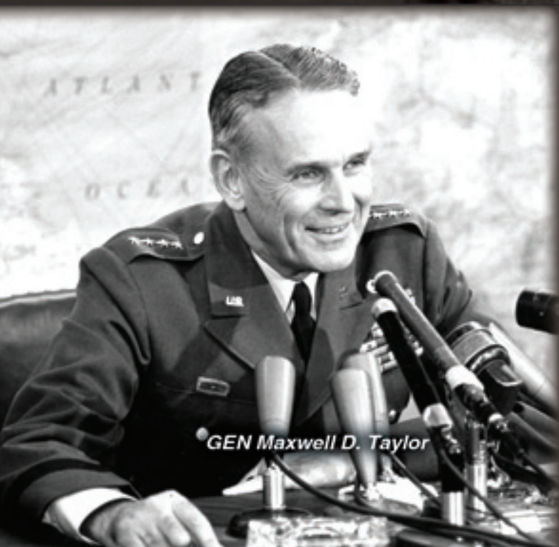
GEN Maxwell D. Taylor