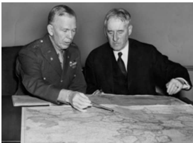
GEN Marshall with Secretary of War Henry L. Stimson.

Not surprisingly, those officers who vigorously advocated their personal advancement had no place in Marshall’s Army. Take the case of LTG Hugh Drum, who had been one of Marshall’s principal rivals for the position of Chief of Staff. Initially advanced by Stimson to head the “China Mission,” Drum made it known that he preferred not to languish in the backwater of the war in a far-off theater. Tempers flared when Drum made his preferences known to Marshall, who told Drum in no uncertain