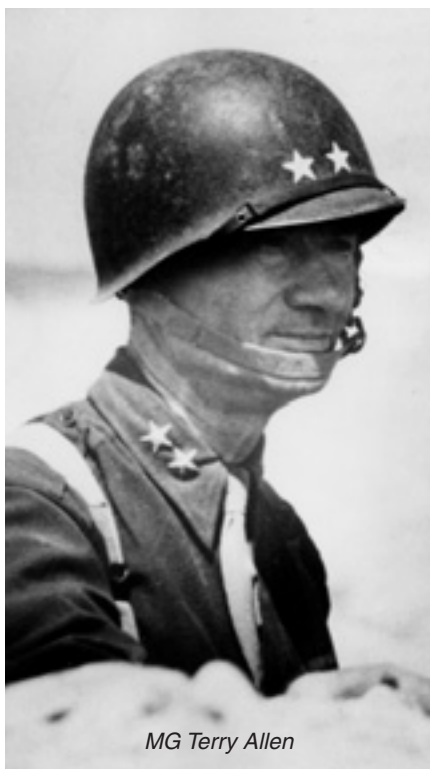
MG Terry Allen

Working in the staff secretariat of the Secretary General staff at the beginning of World War II were several additional Marshall protégés, including Bradley, Clark, Matthew