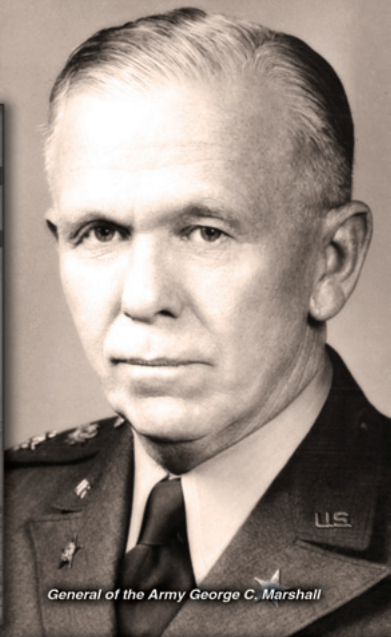
General of the Army George C. Marshall