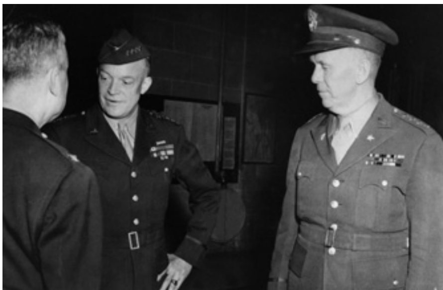
GEN Krueger, left, and, above, GEN Eisenhower and GEN Marshall.

drew the line, informing Ike that the Mediterranean Theater required seasoned commanders as well. He gave Eisenhower most, but not all, of the officers he had requested.