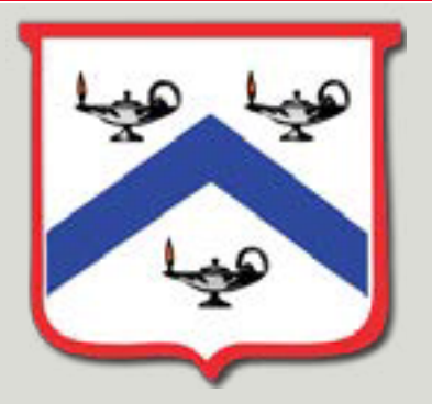
U.S. Army Combined Arms Center and Fort Leavenworth