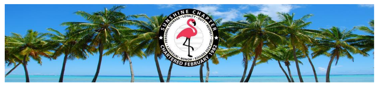
AUSA Sunshine Chapter Newsletter – Fall 2022 (Oct -Dec)

Things are busy, moving along again. Your chapter needs you to know and to become involved. Here is some of the latest news and some upcoming events you can join in on in the future as they come around!