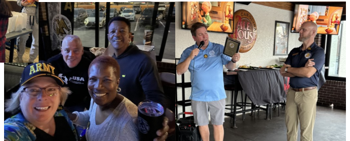
ARMY BEAT NAVY — “HOOAH”