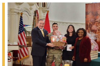
Military Families Pg. #5