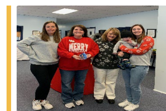
Sponsorships Pg. #6