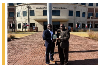
Membership Pg. #3