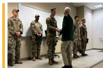
Professional Dev Pg. #4