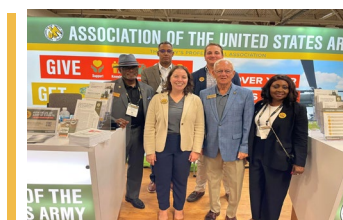
AUSA Warfighter Summit Pg. #6