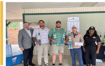
Annual Golf Tournament Pg. #5