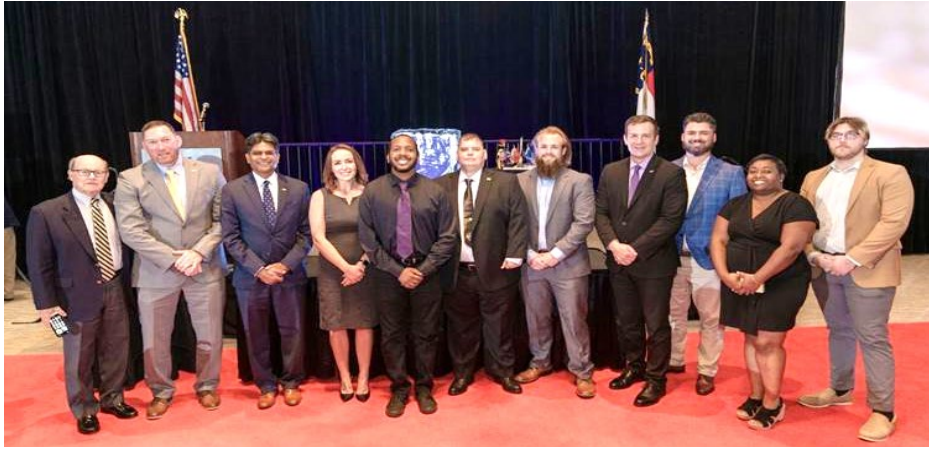
Left: August 2023. The Association of the United States Army, Fort Liberty Chapter Board of Directors, UNCW Sub Chapter President, and UNCW Student Veterans Organization celebrated with alumni and dignitaries at the Cape Fear Purple Heart Dinner on Aug. 5, 2023. This dinner honored 61 Purple Heart recipients, 7 Gold Star Mothers and 6 family members representing an individual Killed in Action. These organizations honored our heroes in a sold-out venue with 475 in attendance.