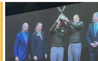
Largest Chapter Award Pg. #4