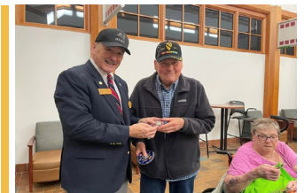
Retiree Appreciation Day Pg. #3