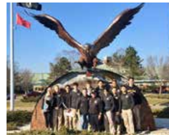
Boys Wrestling Team