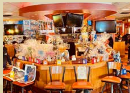
Tricky Tray Raffle Gift Baskets