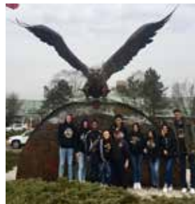
Senior Service Volunteers