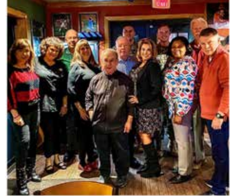
Monmouth Chapter Executive Board