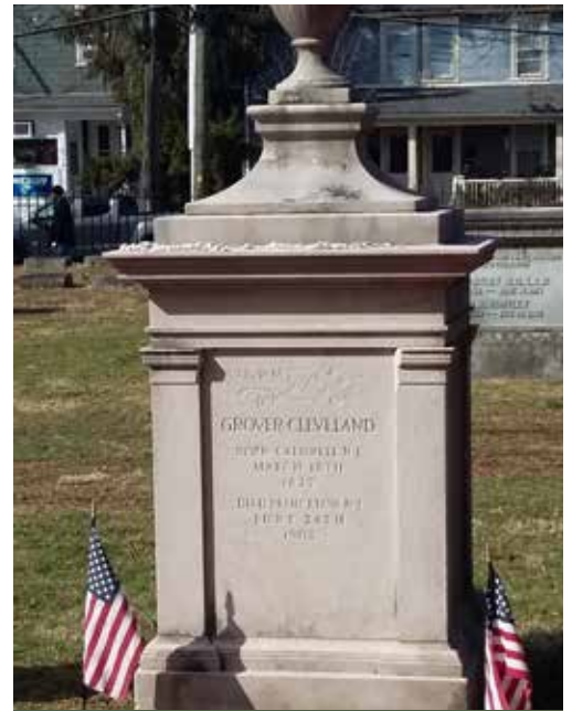
Grover Cleveland Tombstone

Prior to running for President, NJ native Grover Cleveland was Mayor of Buffalo, NY and the 28th Governor of New York. He was both the 22nd and the 24th President of the United States, the only President to serve two non-consecutive terms and the only President to be married in the White House. When he won his first Presidential election in 1884, he broke the longest Democratic losing streak (6 elections) and was the only Democrat to win the Presidency during the period of Republican domination of the White House that stretched from Abraham Lincoln's election in 1860 to the end of William Howard Taft's term in 1913. On October 28, 1886 the Statue of Liberty was officially unveiled to the public by President Cleveland at its dedication ceremony in New York Harbor. The Statue, then called Liberty Enlightening the World, was a gift to the United States from the citizens of France to commemorate a century of US independence. Cleveland was known as the "Veto President" using the power of the Veto more than all the presidents before him combined and was generally known as an honest man who worked hard and tried to act independently as president. According to two of Cleveland's biographers, his last words were, "I have tried so hard to do right." Following his retirement from politics, President Cleveland lived in Princeton, NJ and was a trustee of Princeton University until his death in 1908 at the age of 71.