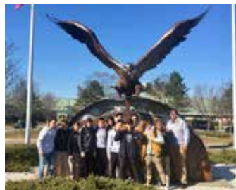
Boys Hockey Team