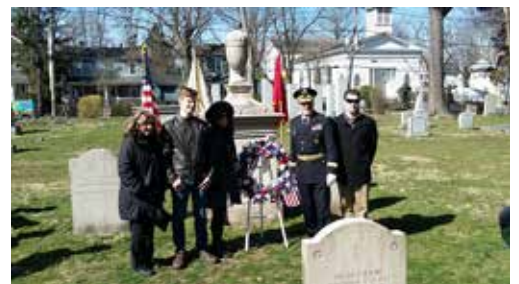
MG Palzer Family