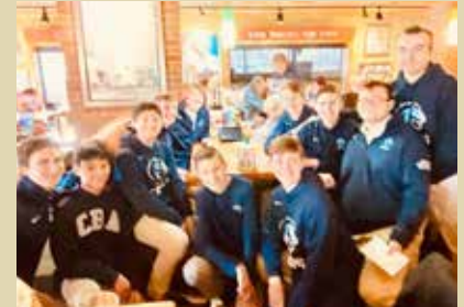
Christian Brothers Academy Volunteers

This event was advertised and promoted to memberships via the websites of AUSA National, AUSA First Region and AUSA Monmouth Chapter as well as Facebook, Twitter and Flyer distribution.