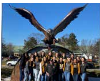
Girls Basketball Team