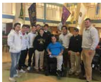
Hockey Team with 90th Birthday Boy