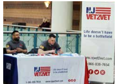
NJ VET2VET Display Table