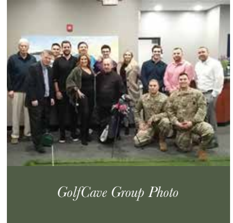
GolfCave Group Photo