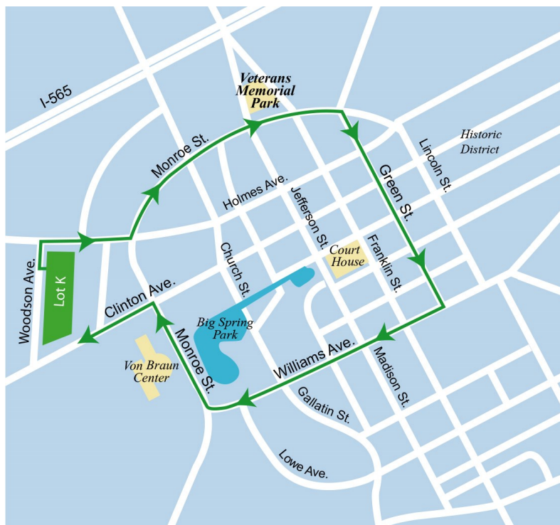
Figure 1. Parade Route