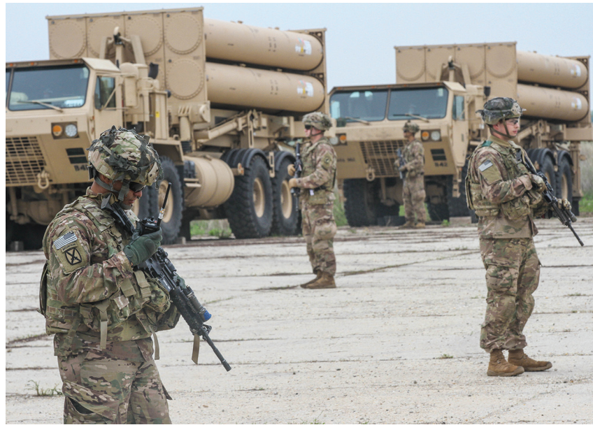
U.S. Army Paratroopers assigned to Chosen Company, 2nd Battalion, 503rd Infantry Regiment, 173rd Airborne Brigade Combat Team, provide security during the deployment of a Terminal High Altitude Area Defense (THAAD) to Naval Support Facility Deveselu, Romania, 15 May 2019.

For the MDTFs, three external factors are essential: the efficacy of JADC2; MDO interoperability with allies; and gaining access in foreign countries within adversary A2/AD networks. The Army should plan for how the