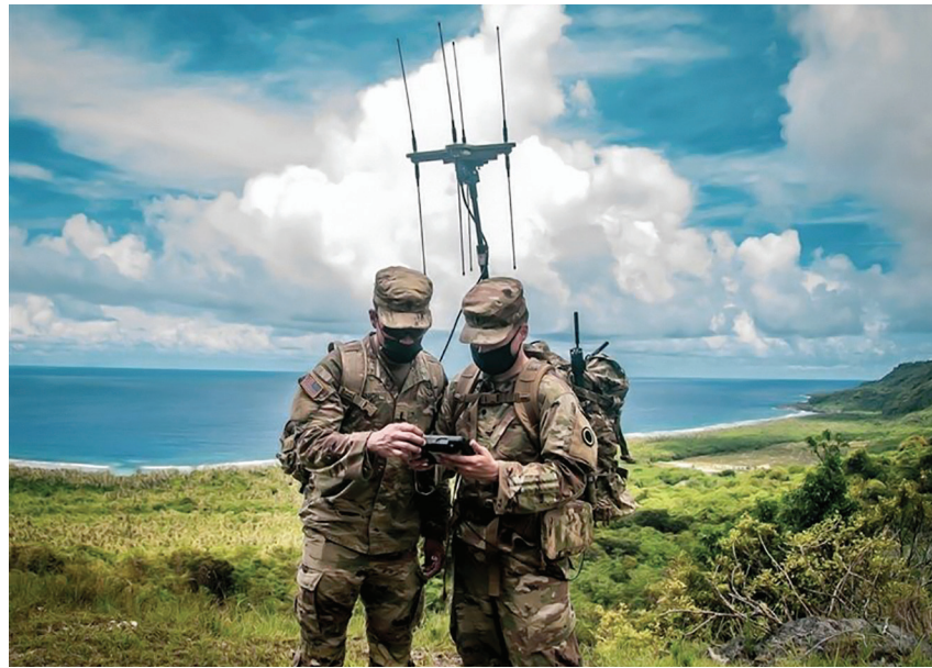
Members of the MDTF conduct operations. Initiated in March 2017 as a pilot program, the MDTF was designed to defeat an enemy’s A2/AD capabilities in the Indo-Pacific region. Later this year, a second MDTF will stand up in Europe. A third task force may also stand up and serve the Indo-Pacific next year.

The Army is creating All-Domain Operations Centers (ADOCs) that integrate the diverse components of the MDTFs. ADOCs are intended to serve as command nodes that enhance information-sharing, allowing commanders to see data from the field and provide faster analyses to ensure that MDTFs persistently compete from home station and while employed forward. 22 The Army intends the ADOCs to be “joint from inception” 23 —fully networked across the joint interorganizational multinational (JIM) spectrum. It is not yet clear at what echelon the ADOCs will provide this integration and whether they would function complementary to centers such as the Air