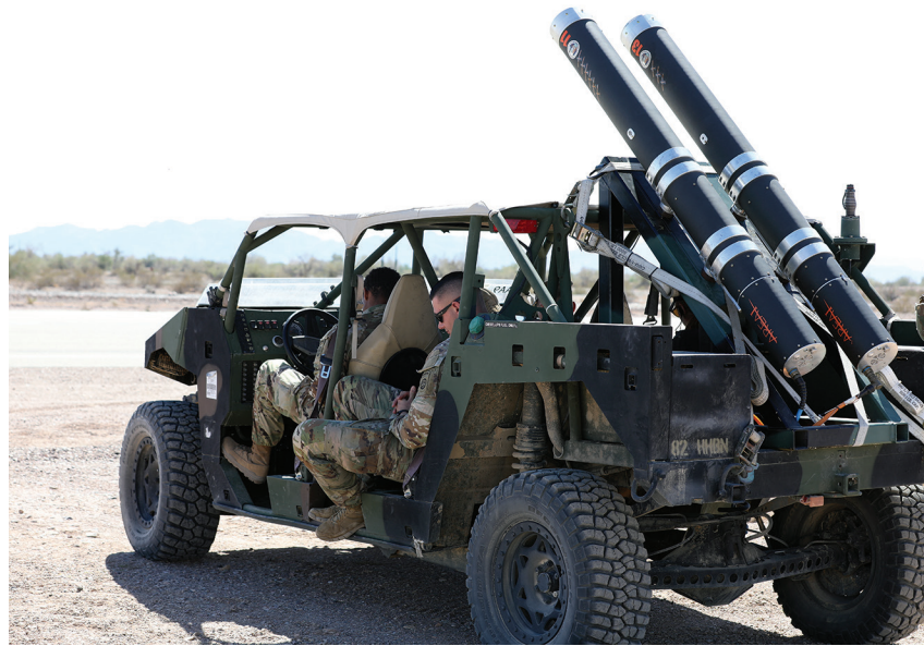
Soldiers assigned to 82nd Airborne Division, prepare to launch an Air-Launched Effect (ALE) on 14 October 2021, during Project Convergence 21 at Yuma Proving Ground, Arizona. The Future Vertical Lift Cross-Functional Team (FVL CFT) experimented with using ALEs to help Soldiers see the battlefield and extend their reach. Using Soldiers in the field allowed the FVL CFT to get valuable Soldier feedback on an emerging capability.

Leveraging this survivability, MDTFs synchronize kinetic and non-kinetic effects to penetrate adversary A2/AD. MDTFs may utilize LRPE to disrupt adversary command and control (C2), communications and cyber networks. The MDTFs can also employ LRPF to destroy enemy targets—whether