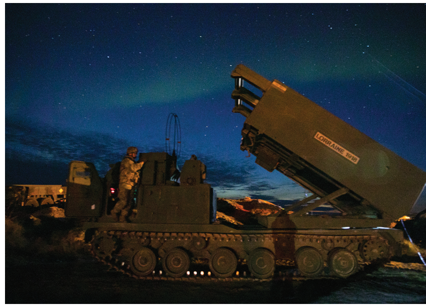
The Northern Lights shone above the Soldiers from the 1st Battalion, 6th Field Artillery Regiment, 41st Field Artillery Brigade, after they successfully fired six M31 rockets from their M270A1 Multiple Launch Rocket System during the Thunder Cloud live-fire exercise in Andoya, Norway, on the night of 15 September 2021. Thunder Cloud was designed to test out the targeting capability of the High Altitude Balloon system coordinated through MDTF-Europe using long-range precision fires on a seaborne target 20 kilometers off the coast on Andoya, above the Arctic Circle (U.S. Army photo by Major Joe Bush).

To be sure, the challenges facing the United States extend far beyond the Pentagon and require a revitalization of American economics and diplomacy. However, the surest way for Washington to invite conflict is through degradation of its military capabilities. At this inflection point, Congress and the American public should recognize that the costs of making the necessary investments to ensure national security would pale in comparison to the costs of ceding its global position to China or Russia.