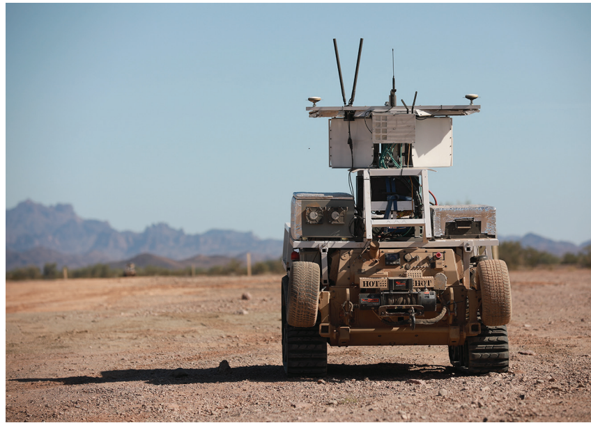
A Robotic Combat Vehicle navigates in the field during Project Convergence at Yuma Proving Ground, Arizona, on 20 October 2021. The Next Generation Combat Vehicle Cross-Functional Team is experimenting with using the vehicle for semi-autonomous resupply, helping Soldiers get the materials they need on the battlefield.

The first MDTF—established in 2017 as an experimental unit at Joint Base Lewis-McChord—is focused on the Indo-Pacific. The Army’s second MDTF was activated on 16 September 2021 at U.S. Army Garrison