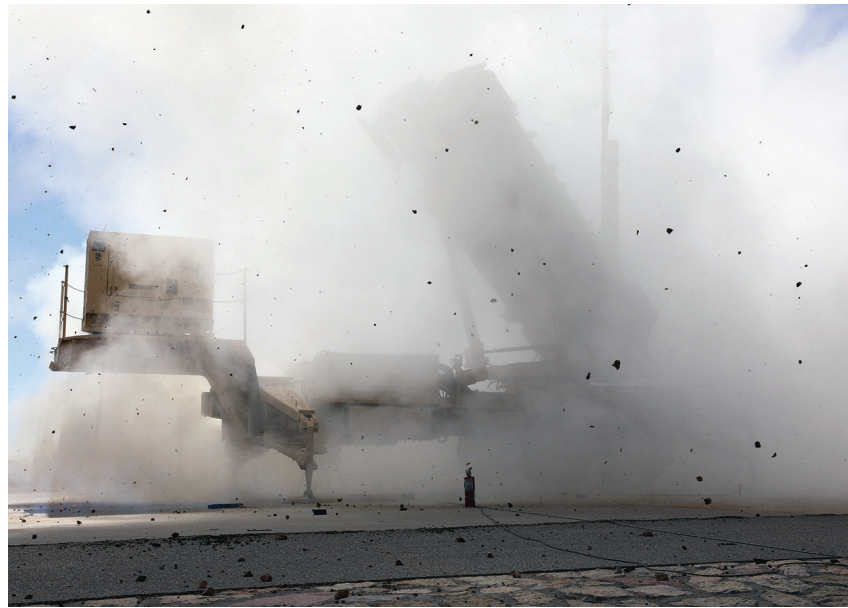
A Patriot Missile System launching a Patriot Missile during a live fire exercise, 6 November 2021, at McGregor Range on Fort Bliss. Soldiers of 38th Air Defense Artillery Battalion and Charlie Battery 1-1 ADA conducted a joint Patriot Missile live fire with their counterparts from the Japanese Self Defense Force’s 5th and 11th Air Defense Missile Groups.

Data is the “ammunition” to achieve this all-domain convergence. As such, DoD continues to develop JADO’s enabler: Joint All-Domain Command and Control (JADC2). JADC2 is DoD’s concept to create a cloud-like environment to connect sensors from all the services into a unified network, facilitating seamless information sharing and faster decisionmaking. 9 By utilizing artificial intelligence (AI) to process the data rapidly and recommend the optimal shooter, the U.S. military intends to achieve decision dominance and overmatch any adversary.