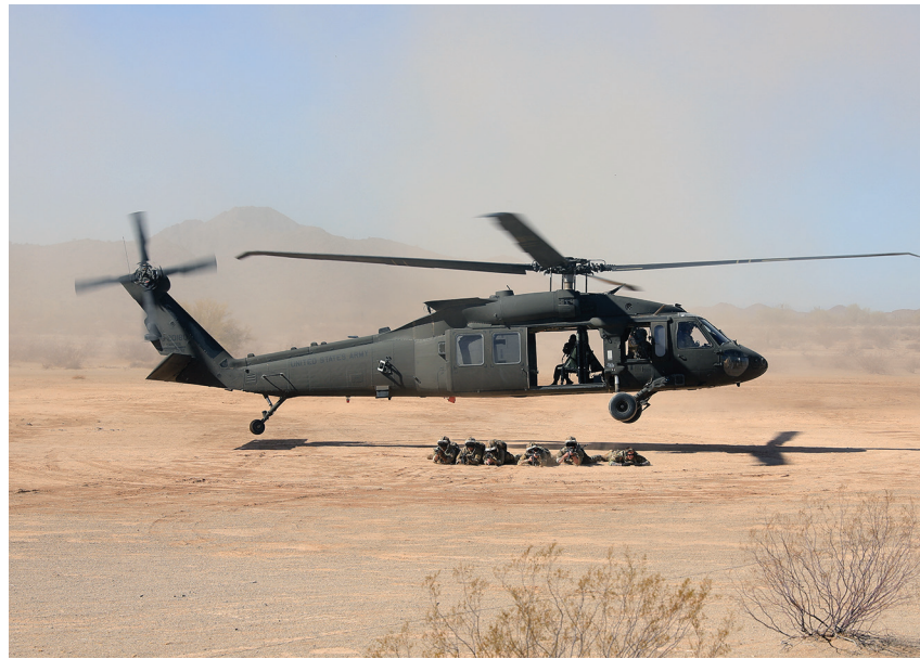
Soldiers from the 82nd Airborne Division take part in an Integrated Visual Augmentation System-enabled air assault exercise on 3 November 2021, on Yuma Proving Ground, Arizona, as part of Project Convergence 21.

Cyber and electronic warfare capabilities provide additional options for persistently competing. MDEBs can employ electronic transmissions to stimulate enemy radars, jammers, cyber defenses and ground units into responses that the MDTFs can analyze. 30 MDEBs also contain the capacity to penetrate adversary cyber networks. During competition, these networks would be monitored for intelligence and scanned for vulnerabilities that the MDTFs could later exploit during a crisis or conflict. The MDEBs could intentionally reveal some successful cyber penetrations to an adversary to achieve cognitive and deterrent effects by signaling potential escalation costs.