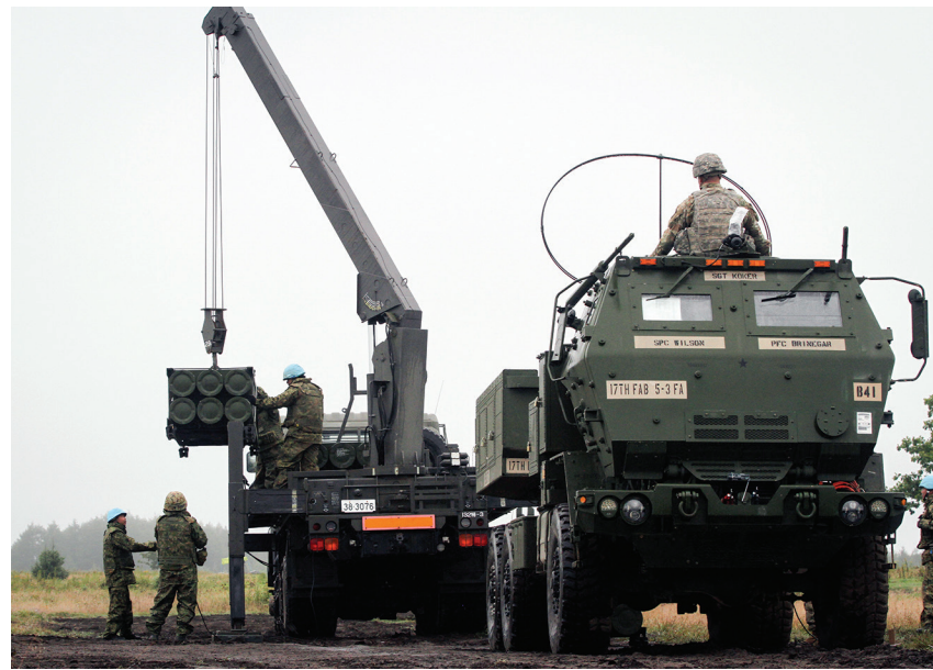
Soldiers assigned to the Western Army Field Artillery of the Japan Ground Self-Defense Force observe and facilitate reload operations on the U.S. Army High Mobility Artillery Rocket System (HIMARS) at Yausubetsu Training Area, Japan, 16 September 2019. Bravo Battery, 5th Battalion, 3rd Field Artillery deployed a HIMARS for the first time to Japan in support of bilateral exercise Orient Shield 2019. The HIMARS is a key capability for the MDTFs, increasing their lethality (U.S. Army photo by Captain Rachael Jeffcoat).

The Indo-Pacific presents a wide array of challenges to the MDTF. First, much of the Indo-Pacific is characterized by vast distances of ocean interspersed by land. This geography results in less area for an MDTF to occupy for advantage (see Figure 2, which represents one example of Army long-range fires capabilities if based in the northern Philippines). As a further complication, no comprehensive regional security alliance exists in the Indo-Pacific; the United States relies primarily on bilateral agreements with Japan, South Korea, Australia, Thailand and the Philippines. 37 This may make the political process of achieving bilateral agreements for MDTF basing in the region more difficult. Last, especially in the medium to long-term future, Chinese A2/AD systems are likely to surpass Russia’s quantitatively and qualitatively, with more significant capability to disable the U.S. military’s communications.